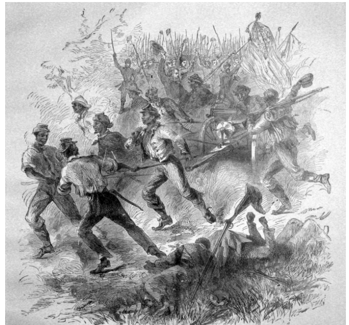
Hinck's Division of USCT (22 nd USCT had many New Jersey men) at Baylor's Farm Near Petersburg VA, Jun 15, 1864 From The Soldier in Our Civil War by Frank Leslie